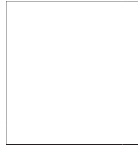
Right index fingerprint of alien removed

(Signature of alien being fingerprinted)